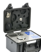
SV 111 Vibration Calibrator