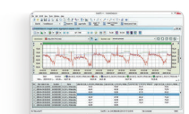
SvanPC++ EM Post-processing software